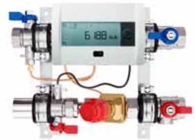
AB-PM rack set including optional heat meter

The Danfoss AB-PM rack set is designed to ensure dynamic balancing and easy installation (even of a heat meter) in manifold systems for radiators or underfloor heating. The set is pre-assembled and pressure-tested from factory and include two brackets for wall mounting. By that the set is easy and flexible to install, the small and compact design fits well in hallway installation, in front of manifolds or in cabinets. An integrated filter in the set removes dirt and particles to ensure continuous performance in the heating system. The dedicated design of the set with ball valves for easy shut-off enables safe commissioning, servicing and maintenance of the manifold and/or heating system.