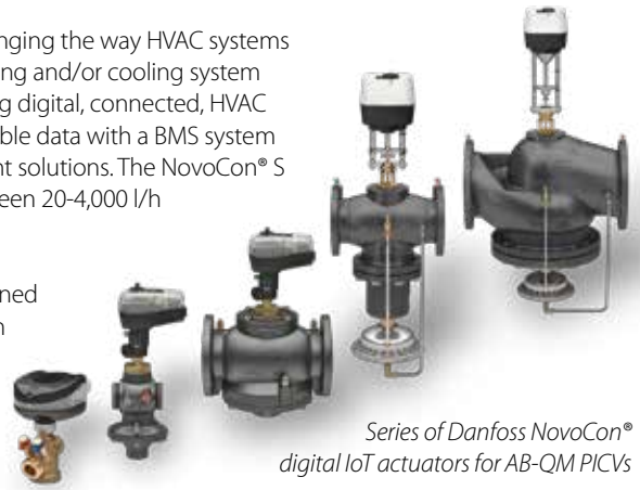
Series of Danfoss NovoCon® digital IoT actuators for AB-QM PICVs

Danfoss NovoCon® M, L and XL are our newest digital IoT actuators. They are designed for high flow AB-QM PICVs in DN 40 up to DN 250 to control design flows between 3-370 m³/h. The series of NovoCon® actuators expands the usability of digital actuators to cover all main hydronic HVAC applications. This allows high-accuracy control of, and data exchange to a BMS from, Air Handling Units (AHUs), chillers and other high flow hydronic applications.