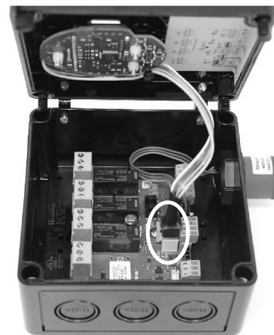
Figure 5: Plug-in the display connector