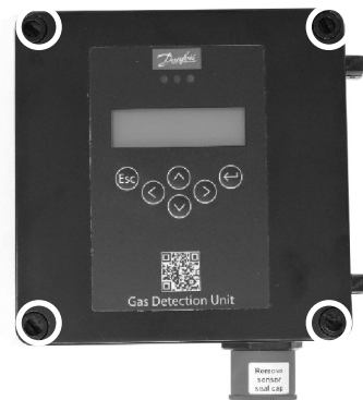
Figure 1: Closed Premium Device