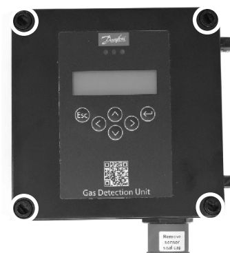
Figure 6: Closed Premium device with new cover and display PCB