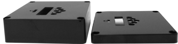
Figure 1: Different cover heights