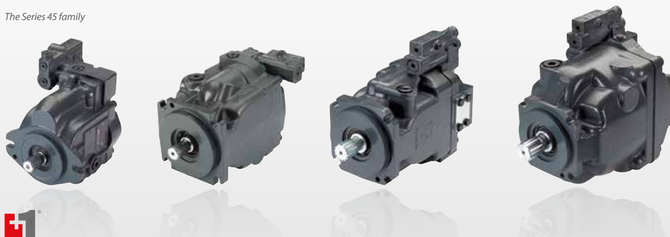
The Series 45 family

Looking ahead, you can continue to count on the high quality products and services you expect worldwide.