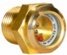
Figure 5: Sight glasses help determine quality of refrigerant and often include a moisture indicator. Ball valves are used to isolate refrigerant before servicing.

But without the right components in place to facilitate efficient inspection and maintenance routines, service engineer visits can take significantly longer than desired.