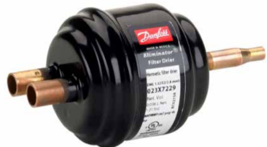
Figure 4: DCL/DML hermetic filter driers are 100% factory leak tested for high system reliability.

In addition, filter driers lower the moisture level in the refrigeration system to a safe design level, which stops corrosive acid from accumulating, and prevents icing.