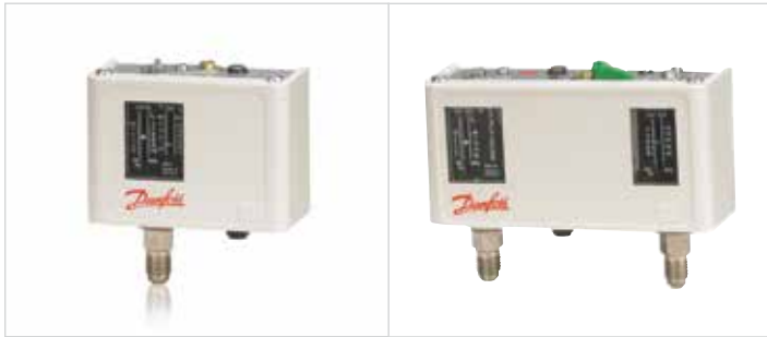
Figure 2. Danfoss KP/KPU switches are designed to protect systems from excessively high discharge and low suction pressures.

It not only makes our components compliant with evolving regulations but also provides peace of mind for manufacturers and operators by knowing their components are recognized by an international safety body.