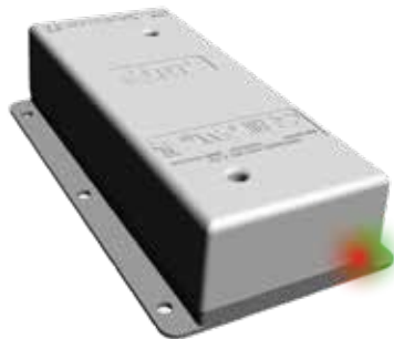
Figure 1. Prosa telemetry device can be factory fitted or retrofitted by installers, enabling connectivity even for older systems.

Through the Prosa cloud-based infrastructure, the Prosa telemetry devices and the electronic controllers,