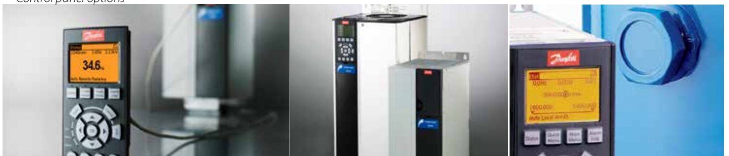
Control panel options

provided by the speed reduction at night and the limited number of starts and stops.