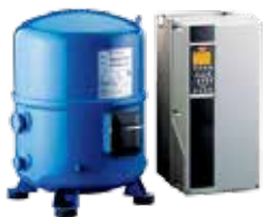
VTZ 242-G & Compressor Drive 22.0 kW