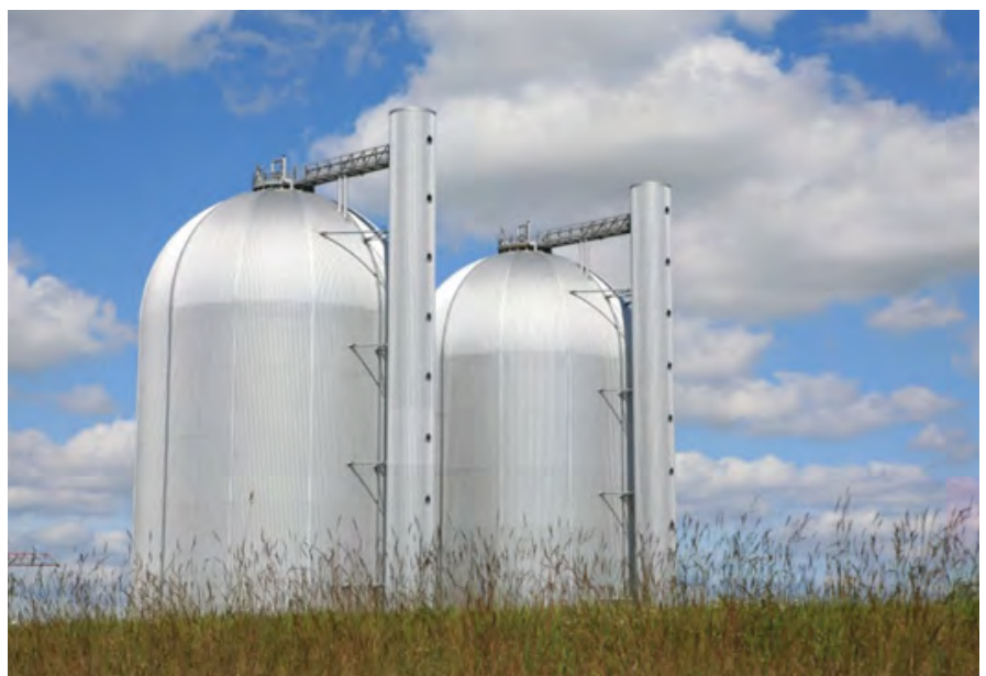
FIGURE 3: Heat storage, 2 x 24,000 m 3 up to 120°C and 10bar pressure