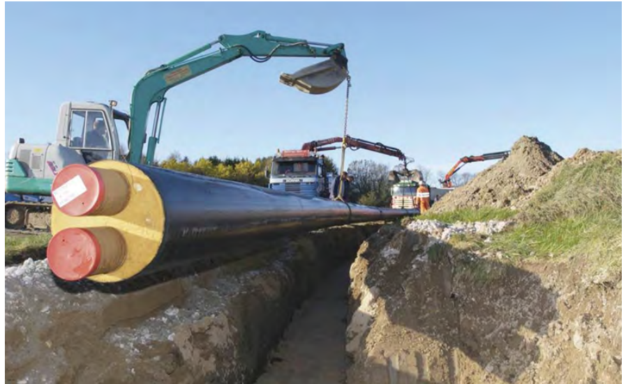
FIGURE 1: Pre insulated pipes laid direct into the ground

Compared to the 2 nd generation principles, where substations were typically build on site, the 3 rd generation substations are prefabricated in industrialized processes where materials and labor is reduced. Focus is on energy efficiency regarding the heat exchanger, the control components, the insulation of the substations and also the physical dimensions or compactness. The heat exchangers are typically made by copper brazed stainless steel plates and are very compact. They have a high heat transfer rate pr. weight unit and a long life time. The general trend for heat