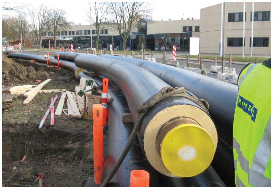
FIGURE 2: Prefabricated curved pipes