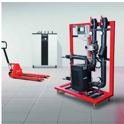
FIGURE 4: Compact insulated prefabricated substations. One type with cover and one type without cover

As alternative to prepare the domestic hot water centrally for a multi-family house, the concept of flat stations emerged. The concept is to have a substation in each apartment, where fresh domestic hot water is prepared for each flat at the time of usage. Hereby only a small volume of domestic hot water is hold up in the pipes, leading to a higher level of hygiene e.g. in relation to bacteria growth, such as the legionella bacteria's. This