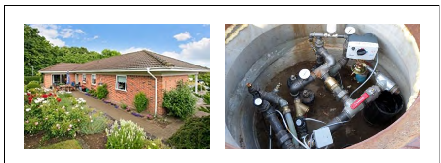
Figure 3: left: One of the houses in Odder project; right: Mixing shunt for experimental loop

We installed the units into five single-family houses in city of Odder, Denmark (see Figure 3-left). The houses were built around year 2000 and they are heated mostly by floor heating. Two of them have few additionally radiators originally designed for supply/return/room temperature 70/40/20, those were replaced with ones with larger heating surface to enable the use of 40°C supply temperature as long as possible. All five houses are situated