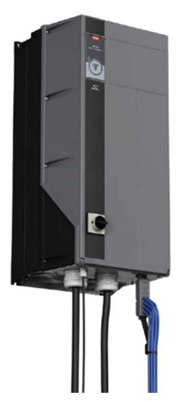
The PTU 025 is easily mounted into the FC 102 drive enclosure, and provides 360° access for optimal tube connections.

It is easily mounted into the enclosure of the VLT® HVAC Drive, and retrofitted existing drives.